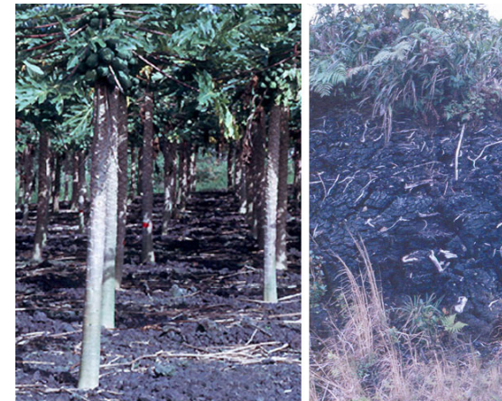
Papai Series, Hawaii