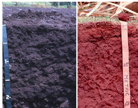
Kawaihapai Series, Oahu