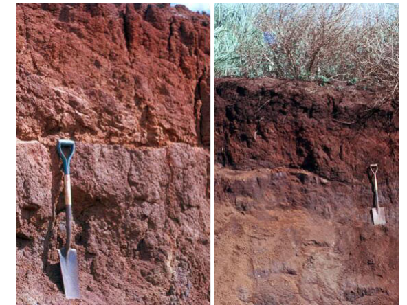
Kolekole Series, Oahu

Inceptisols are soils showing minimal development of soil horizons. The Kolekole soil on Oahu is an example.