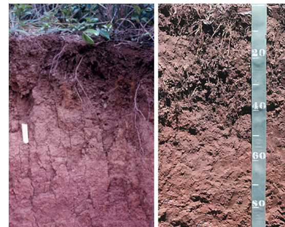
Alaeloa Series, Oahu