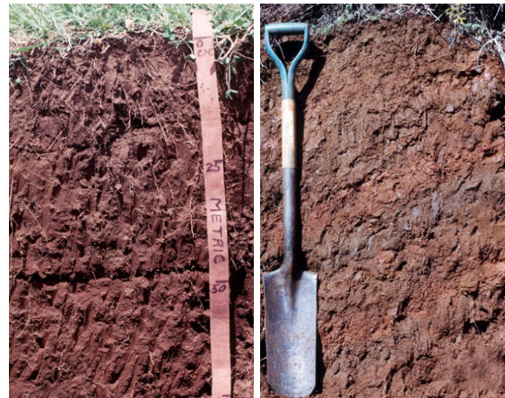
Kula Series, Maui