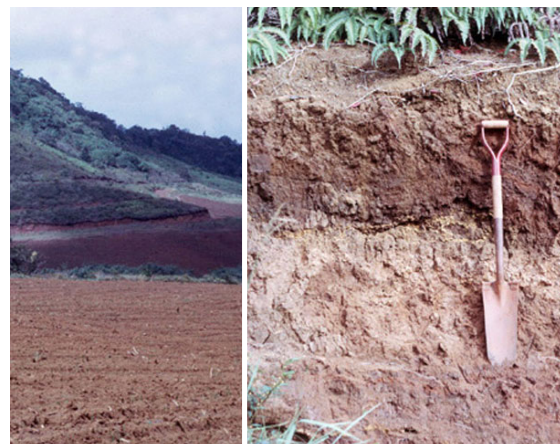
Halii Series, Kauai

Oxisols are the most weathered soils of the tropics with low nutrient holding capacity and high Fe and Al oxides. The Halii soil on Kauai is an example.