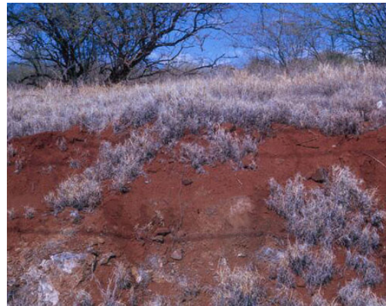
Kawaihae Series, Hawaii

Aridisols are soils of the arid areas or soils with high salt content. The Kawaihae soil of the Big Island has features of an arid area of light color, low organic matter, and shallow depth.