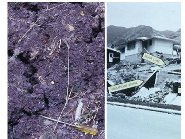
Lualualei Series, Oahu

Vertisols are soils that shrink when dry and swell when wet. They usually occur in valleys with poor drainage. They are fertile, but pose severe limitations for roads, housing, and related uses. The Lualualei soil on Oahu is an example.